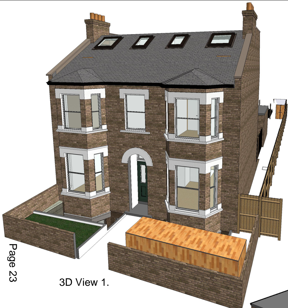
3D View 1.