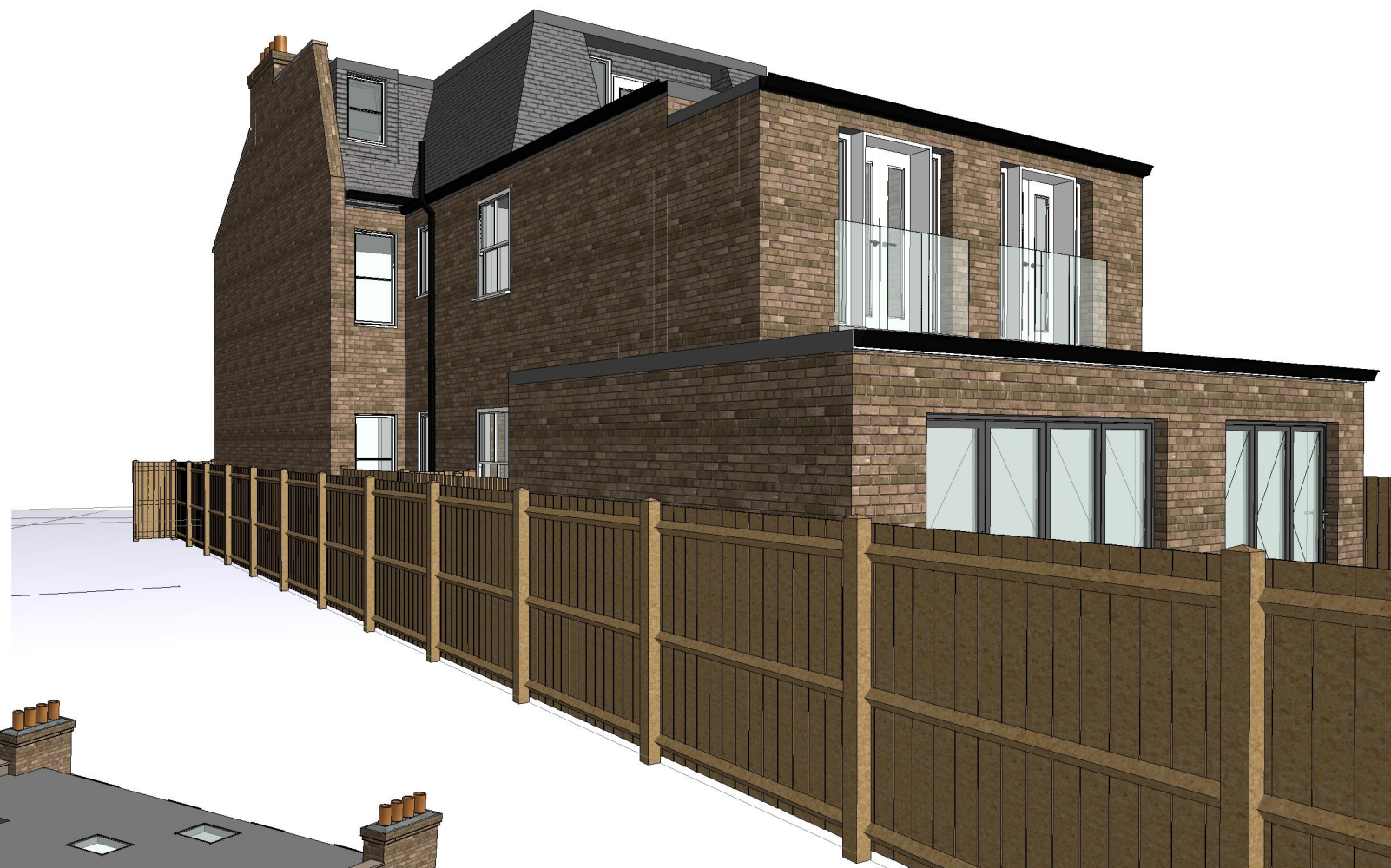
3D View 2.