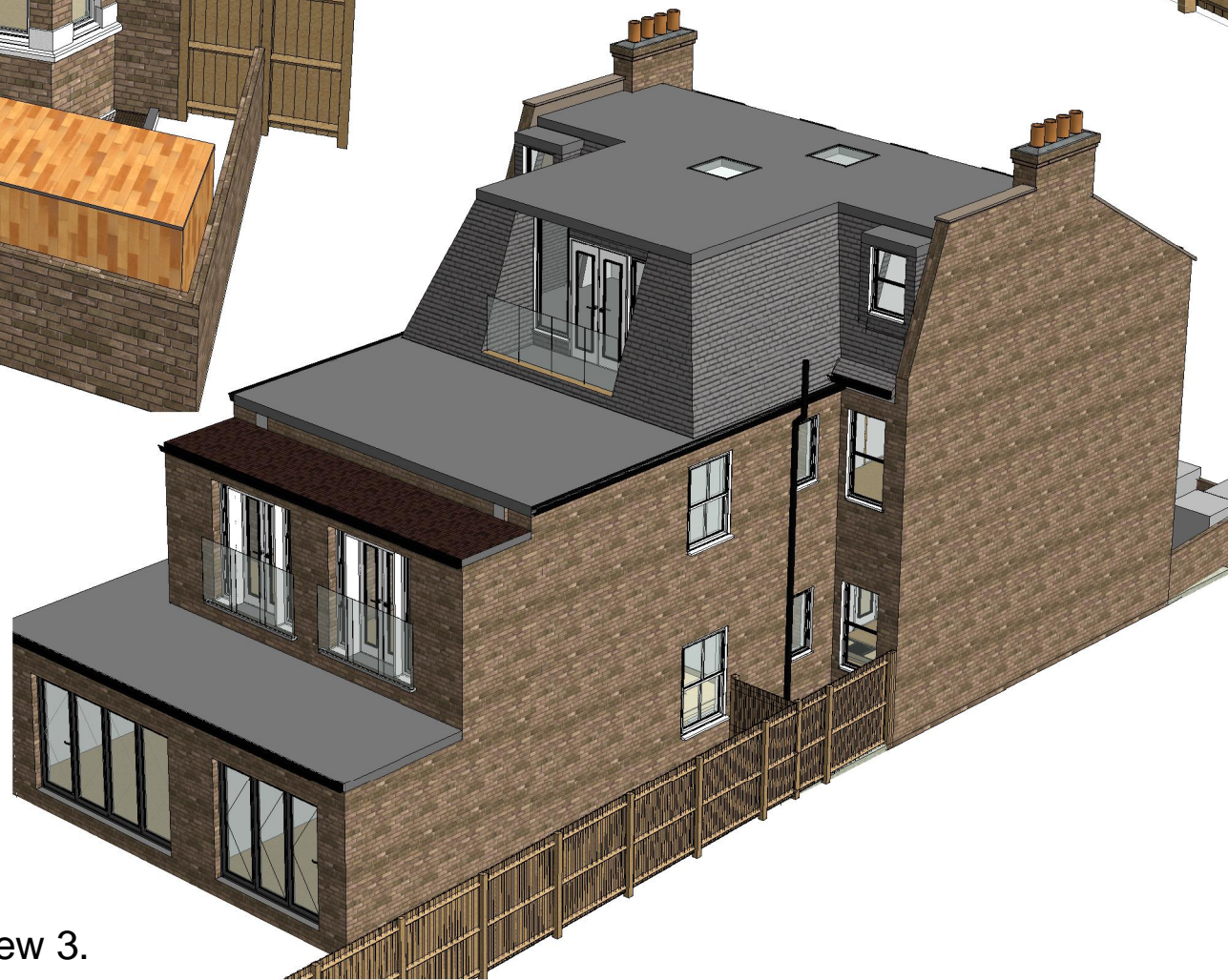
3D View 3.